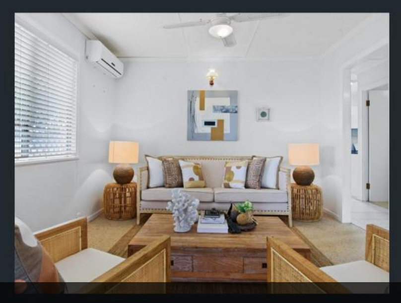
161 Dawson Rd, Upper Mount Gravatt